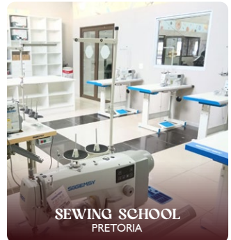
SEWING SCHOOL PRETORIA