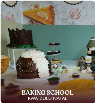
BAKING SCHOOL KWA-ZULU NATAL