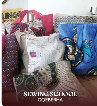
SEWING SCHOOL QOEBERHA