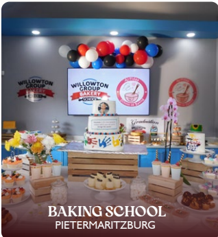
BAKING SCHOOL PIETERMARITZBURG