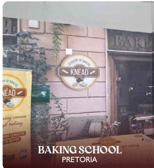
BAKING SCHOOL PRETORIA