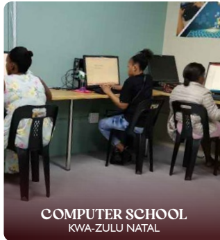
COMPUTER SCHOOL KWA-ZULU NATAL