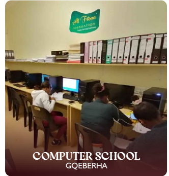
COMPUTER SCHOOL QOEBERHA