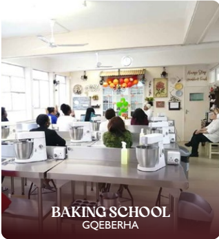
BAKING SCHOOL QOEBERHA

Al-Fidaa Foundation Skill Centres in South Africa